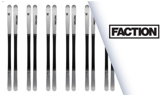
Faction Le Mogul

Coming in at number 2 is the Faction Le Mogul. Faction has recently been making their way into the mogul ski market, and they are doing it well. Offering a true mogul ski that is light, reactive, and playful, Faction seems to have their mogul skis dialed in. While inventory from faction is a little low this season, this ski can be still be found in a range from 140cm to 179cm. It has been a popular ski with many on the team over the last few seasons and we only expect that popularity to grow.