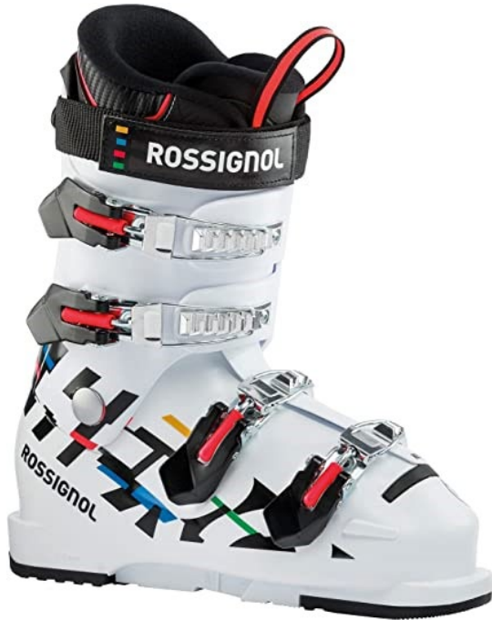
Hero Jr 65

Our number 3 boot on the list rounds out the full-size range of boots that our athletes may need. If your athlete doesn't fit into either the Revolver Pro or the Evolver this a boot that you should be searching out. The Hero Jr 65 is a great cross over boot being offered in sizes as low as 19.0, it can span the gap between an entry level boot and skiers that are ready for a higher level boot. The Hero Jr 65 offers a soft flex rating and great forward pitch for a smaller boot. This boot is designed for all of the little rippers out there who have outgrown the need for a beginner boot but haven't necessarily outgrown the sizing of those boots.